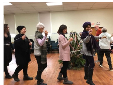
Decking the Green Man with ribbons Winter Solstice 2022