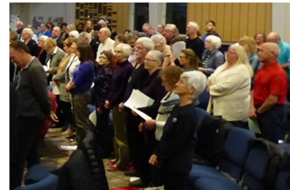
We are part of Calgary Alliance for the Common Good